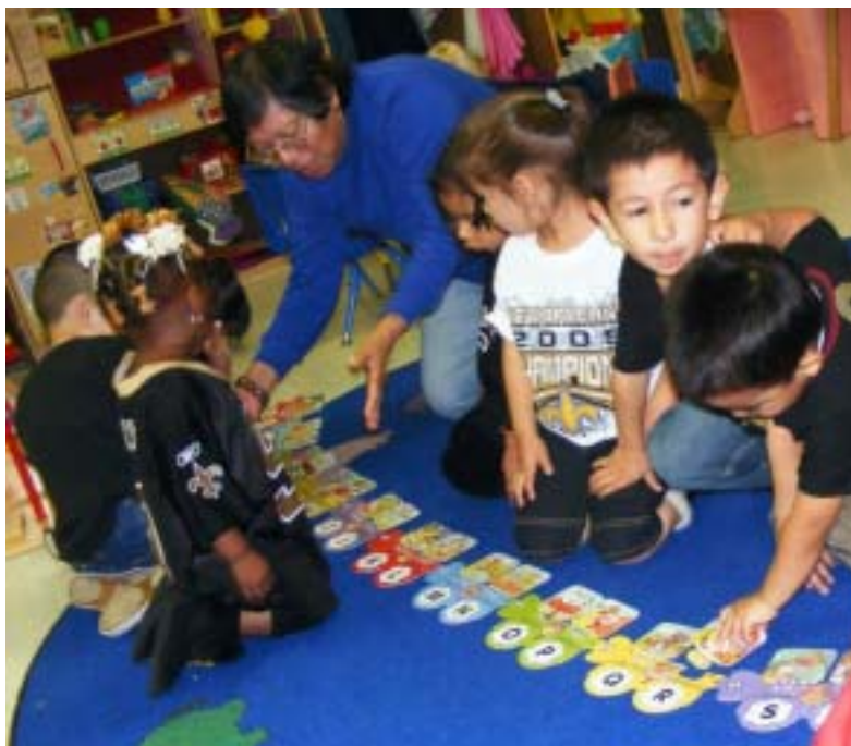
An early childhood education activity at the Westbank Even Start

Even Start services families with children between six weeks and seven years of age with a parent or parents in need of academic upgrade such as obtaining a General Education Development (GED) diploma, obtaining English language skills, gaining employability skills, obtaining post-secondary educational skills, etc.