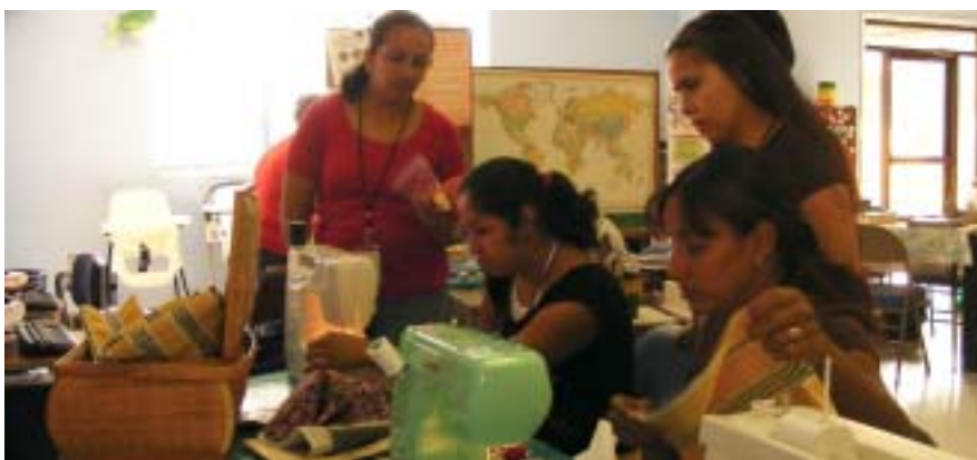
Students at the Westbank Even Start Family Literacy Center take part in a sewing unit to put numeracy and literacy skills into action

Family literacy programs look to educate parents on how to educate their children because early literacy is the first line of defense for counteracting statistics like the ones above. Exposure to literacy is essential for children who will be entering preschool. According to the Department of Education, "A kindergarten student who has not been read to could enter school with less than 60 hours of literacy nutrition. No teacher, no matter how talented, can make up for those lost hours of mental nourishment."